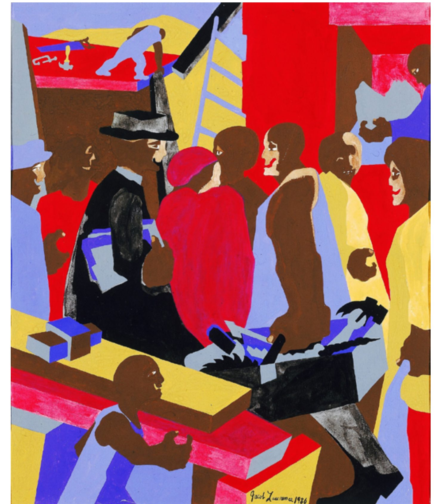
Jacob Lawrence, Community (study for mural, Jamaica, NY), 1986, gouache on paper, Smithsonian American Art Museum.

The commissions were part of the Art-in-Architecture program of the General Services Administration. Under this program, one-half of 1 percent of the estimated construction cost of a Federal building could be spent on art for the site.