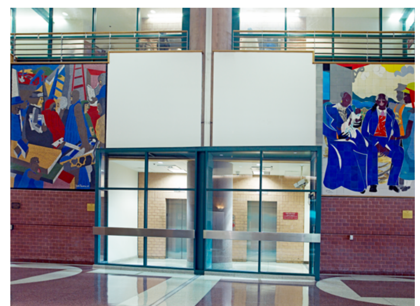
Community and Family (1989) at Joseph P. Addabbo Federal Building, Jamaica, Queens. Photographed as part of an assignment for the General Services Administration. Ceramic tile, glazed.