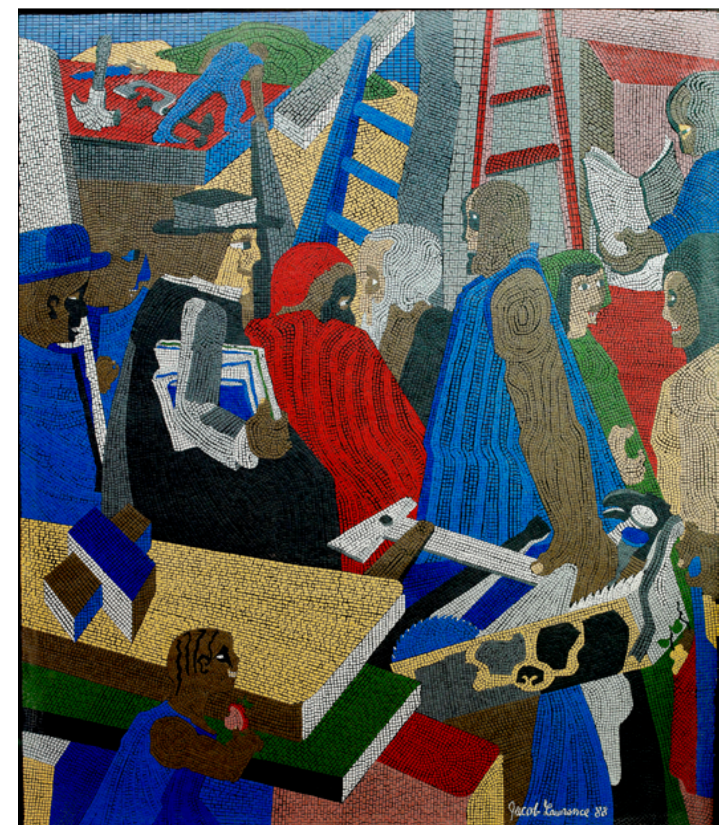
Community by Jacob Lawrence (1989) Joseph P. Addabbo Federal Building in Jamaica, Queens.