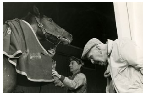
▶ Trainer Sunny Jim Fitzsimmons

The Queens Historical Society opened two exhibitions on October 8th — The Sport of Kings in Queens: Celebrating 350 Years of Thoroughbred Horse Racing at Kingsland Homestead and Past Performances: Legends of the Queens Turf at Flushing Town Hall.