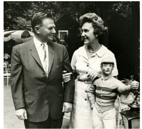
▼ Trainer Hirsch Jacobs and wife Ethel in backyard of their home in Forest Hills, NYRA.

special tours. The exhibit proved to be a hit with the media. There were 15 articles in 10 publications. There were about 35 photos – some on front pages. QHS also received very nice TV coverage on NY1, and on social media and many organizational websites. Queens Poet Laureate Maria Lisella visited and later sent a message complimenting QHS on the extensive media coverage it had received.