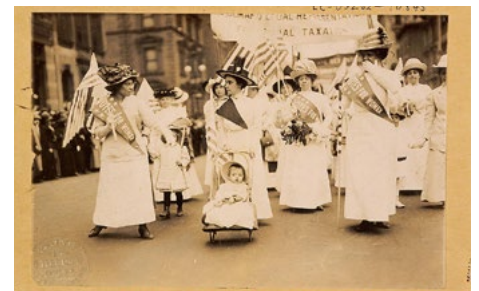
▼ Youngest parader in New York City suffragist parade, May 4, 1912.

On this centennial, let's appreciate the complexity and multi-dimensional aspect of the women's movement, which is so often boxed into a few takeaway images and phrases. Central New York no doubt houses the direct roots of the movement, but Queens can definitely claim some bragging rights!