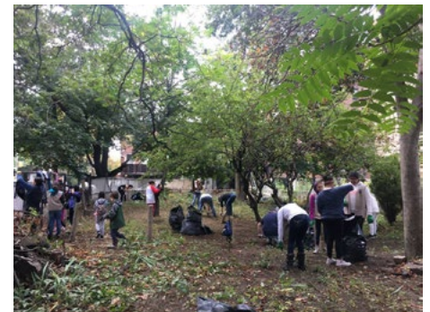
▼ Volunteers raking and bagging by the tombstones at Moore-Jackson Cemetery.

We've also added a new feature with a culminating concert at Friends Meeting House included with admission. Please see the list of all events on page 6 for more details on upcoming events.